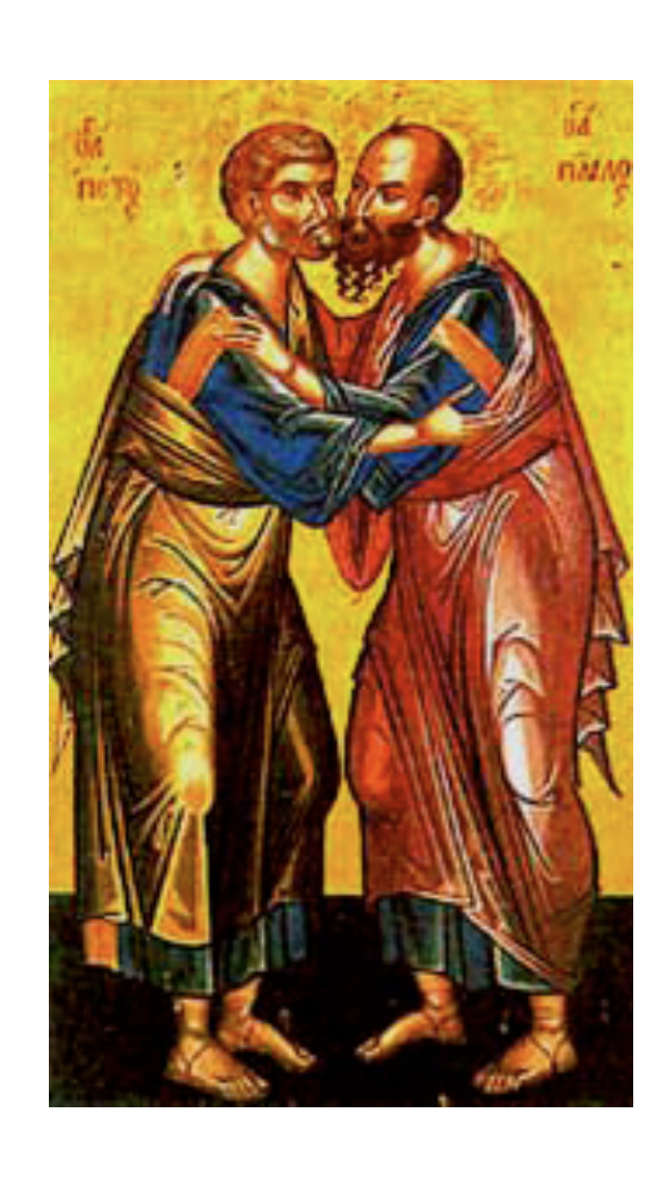
Church Bulletin ~ February 2009