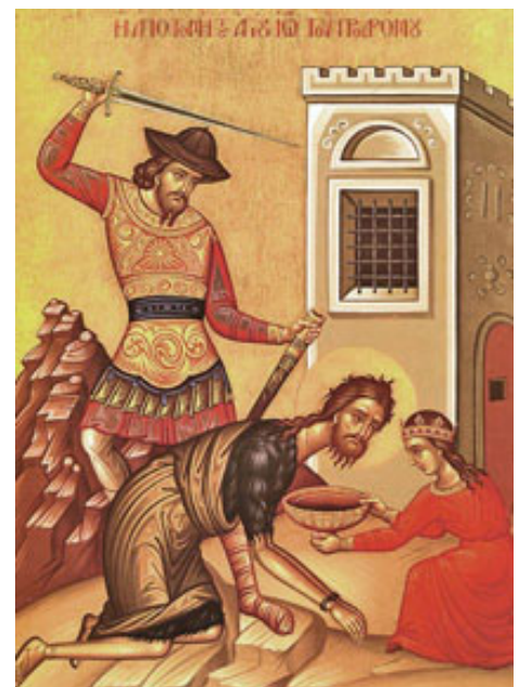
Reading & Icon Courtesy of OCA Website

Today the Church makes remembrance of Orthodox soldiers killed on the field of battle, as established in 1769 at the time of Russia's war with the Turks and the Poles.